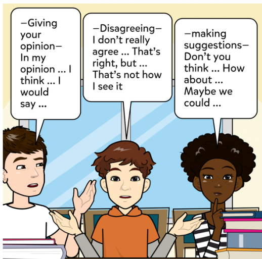
useful phrases for discussion

1 What do you think is the most important message of this text?